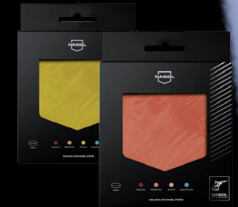
Nasiol Backing Plate

Innovative air channel system, facilitate the evacuation of the heat generated during the polishing process and prevent overheating. It protects pads from getting deformed or torn after washing. It is easy-to-applied even in the most curved areas and suitable for both rotary and orbital polishing machines.