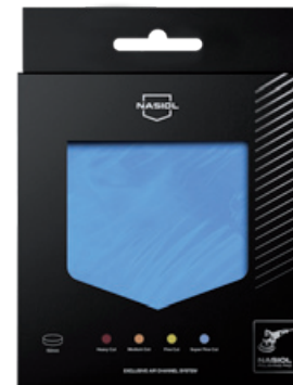
Super Fine Cut

Nasiol CleaRub 705 is a high-tech finishing compound that designed and improved to remove polishing marks, micro-scratches, and holograms. CleaRub 705 can be used on both brand new and old paints to get deep shine effect.